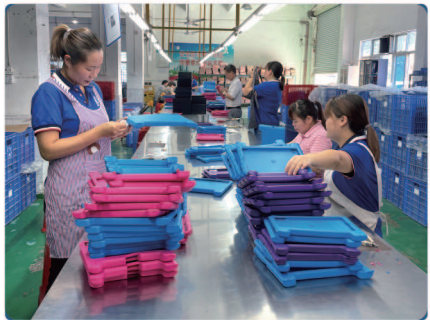
Edge grinding process