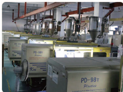
Plastic Injection Department